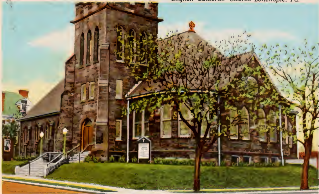
English Lutheran Church Zelenople, Pa.